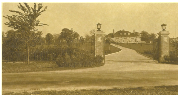
(Braebourne Estate as seen from Riverside Drive, constructed in 1922)

Please use the form on the reverse side if you would like to join, renew or give a gift of membership to the Historic Allouez Society.