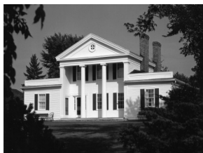
The Cotton House located in Heritage Hill State Park

The Society publishes a quarterly newsletter, Le Journal d'Allouez , which highlights historical families, buildings, sites or events. The newsletter lists events that the Society has to offer. Membership includes issues of the newsletter.