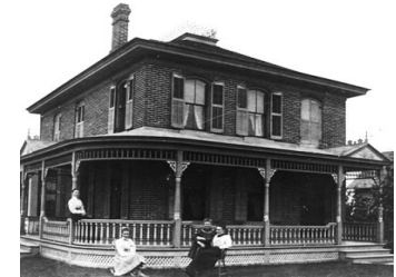
Hochgreve house 1860

The first annual meeting of the Historic Allouez Society was held October 23, 2008. The Board meetings are held the fourth Thursday of each month at 7 PM. The goal of the Historic Allouez Society is to preserve the history from Shantytown to present Allouez. H.A.S. will do this through research, education, events of local interest and the media.